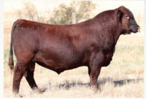
RED SIX MILE MONTGOMERY 656J

REG NO. 2224508 TATTOO SIXM 656J DOB MARCH 8, 2021