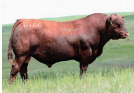
RED MAR MAC LINCOLN 106H

RED SSS TYCOON 225E X RED HOWE JOANNA 145C