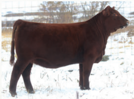
SIXM 110H | MATERNAL SISTER