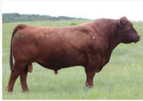
RED NCJ COMING IN HOT 24E

RED CROWFOOT MOONSHINE 8081U X RED OHRR 146T TRISTEE ANA 60A