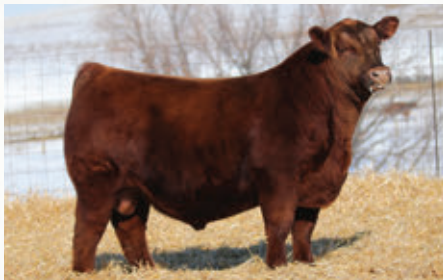
RED SIX MILE JOHN WICK 882E | SERVICE SIRE

Choice of Maternal Sisters. Mark this one high. The Lakota cow family strikes again with this gorgeous Fifth Sense daughter. Her dam 213C is really starting to turn it on in production, her bred heifer was selected by Blake's Red Angus last fall in Genetic Focus. These 2 maternal sister pairings demonstrate the consistency and quality bred into this cow family.