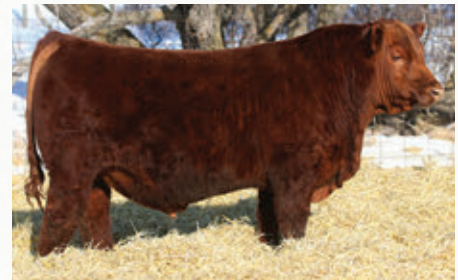
RED SIX MILE BADGER 529G | SIRE