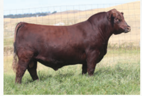
RED SIX MILE GENTRY 342G

RED SIX MILE JOHN WICK 882E X RED SIX MILE KURUBA 712A