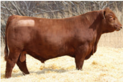
RED LWNBRG HOT WIRE 34H | SIRE