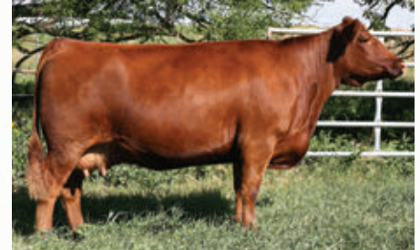
RED SIX MILE LASSIE 377P MATERNAL GRAND DAM

Remember the three certainties in life: taxes, the Leafs never winning Lord Stanley's Cup and a Lassie bred heifer highlighting Genetic Focus. This female is just awesome; I think she needs to be seen in the flesh to appreciate how good she is. Her dam is a gorgeous young productive cow who will most likely find her way to the donor field if she keeps producing at this level. She just weaned one off a stud bull calf at the top of the pen. Bid with confidence on 624J.