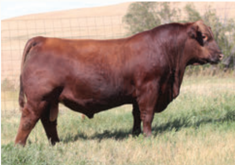
RED WHEEL STARK 67G

RED SIX MILE GENTRY 342G X RED SOO LINE MS BANE BERRY 0033