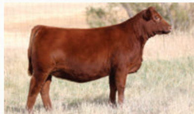
TAFETTA 70K | STARK DAUGHTER & PICK OF THE HEIFER CALVES

Offered with Wheeler Stock Farms, SK FOB Alta Genetics, Balzac, AB