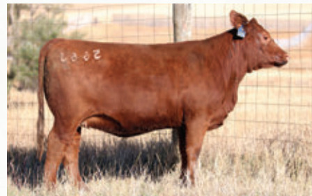
RED SIX MILE FRADO 566J