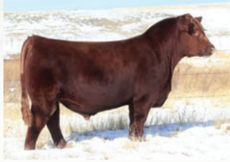
RED SIX MILE PARABELLUM 675G

RED U-2 RECKONING 149A X RED SIX MILE & CO GLORIA 29A