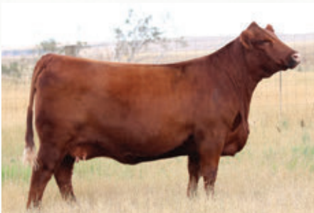
RED SVR RUBY 46H | DAM