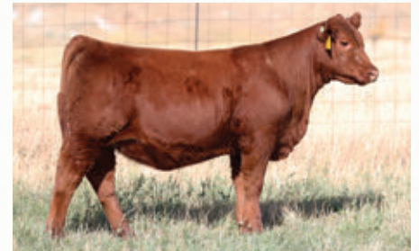
RED SIX MILE MISTY 497K

Here's a unique built heifer. She is long and slender necked, deep bodied and heavy structured. Her sire, Redwing, was selected by Peacock Angus Ranch in Texas for $30,000 in our 2021 bull sale. Redwing combines the highly productive Marta cow family with the exciting Red Box AI sire. Her dam was acquired with the Cactus Coulee cowherd and has produced one female selling to Camo Cattle and 2 daughters retained in the Six Mile herd.