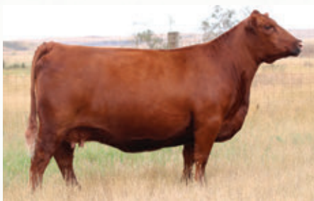
ENID 232G - MATERNAL SISTER