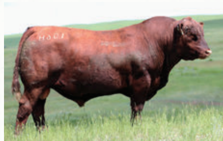
RED MAR MAC LINCOLN 106H SIRE TO LOTS 32 | SERVICE SIRE TO LOT 33