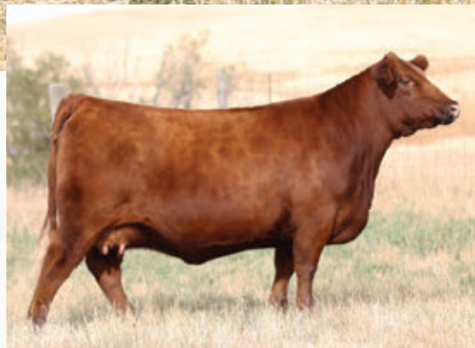
RED SIX MILE MS EXTRA 373H | DAM

The only Parabellum heifer in this sale and again out of a cow that the keen eye of Ty Buist scooped up. This March show heifer prospect is super stout featured and real shaggy. Her sire, Parabellum is really causing quite a stir in the USA this fall as online sales start popping up. He injects a dark red color, undeniable presence and added frame to his offspring while maintaining foot quality and structural integrity. Her dam was the high selling bred heifer last fall that dropped a gorgeous udder at calving time. We plan on showing this heifer alongside her dam this fall at Farmfair and Agribition.