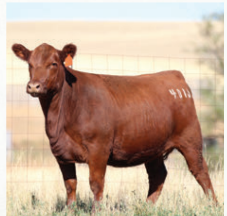
RED SIX MILE MS FRADO 401J

Early service to John Wick only adds value to this high quality Fifth Sense daughter from the famed Frado cow family. She is bold from every angle with a proud and attractive front end. The dam of this heifer was one we lost too early. She was a daughter of our new up-and-coming donor Frado 133B. 401J is one to mark high on sale day, she's a safe investment.