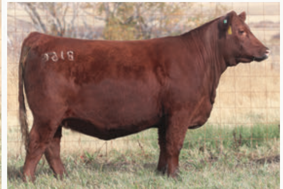
SIXM 816G | FULL SISTER TO LOTS 44 & 45

One really neat part about this Marta Choice Lot, is they are both carrying service to Stark (Sexed Female Semen) which makes the resulting heifer calf a full sister in blood to the high quality Lot 7 heifer calf. Our daughter, Sloane, also selected her first show heifer at a very early age and she is the Marta-Stark genetic combination as well! A big time opportunity on some of our most predictable genetics!