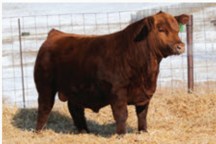
RED SIX MILE ENFORCER 204E SIRE OF LOT 4

Maternal Sister to Semex/Moose Creek sire "Mossy Oak". The largest outlined of the three sisters (Lot 2-4), Lark 130K is long spined and very attractive. She is sired by one of our most under-utilized female makers, Enforcer 204E; look for more of his influence in the future as we increase his AI usage. The Lark cow family is very prevalent in this year's sale and has stood the test of time in our herd; longevity is bred into them.