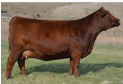
RED SIX MILE LASSIE 207Z | DAM