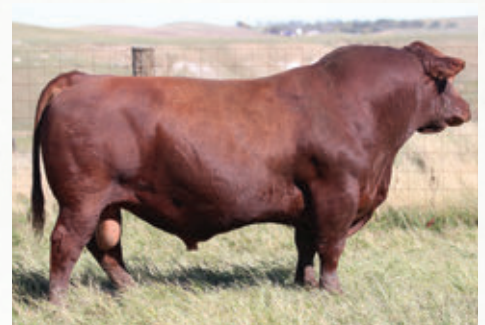
RED HRR EQUITY F039

RED ROJAS RIOJA 6052 X RED SRA PAINTBUCKET