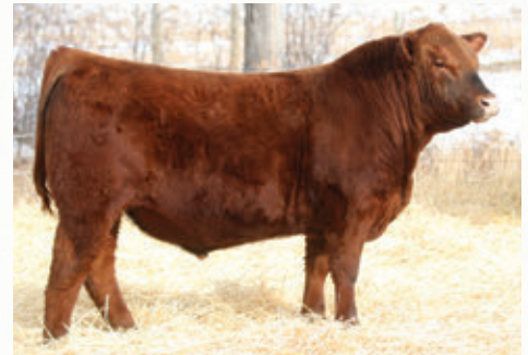
RED SIX MILE SUN JUMANJI 642J

RED RUST BULL 31B X RED SIX MILE MINERVA 584B