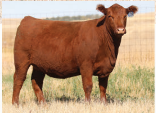
RED SIX MILE LAKOTA 745J