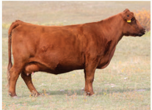
RED SIX MILE LAKOTA 848A | GRAND DAM