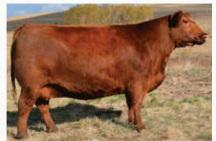
RED SIX MILE LAKOTO 35W | GRAND DAM

Another Wrangler daughter that we expect to shine in production! Her dam is a full sib to Game Face 164Y. This female does so many things right; she offers genuine base and pin width and added red meat down the top side of her skeleton. She looks like a herd bull maker!