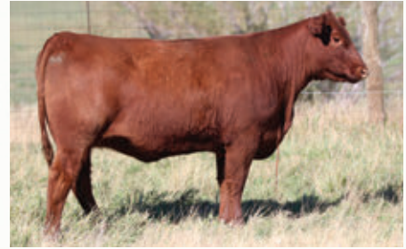
SIXM 320H | MATERNAL SISTER

From nose to tail, this is the longest heifer in the sale (I should be a poet). I do think this industry, probably more specifically the Red Angus breed (including our own operation), needs to be reminded that spine length is the easiest way to add pounds on the scale. Also, I believe the longer spined cattle are generally sounder and more athletic; increased longevity. But that's just my opinion and with my hiatus from social media; I use these footnotes as a platform to be a keyboard warrior! This heifer was one we debated about putting a halter on and promoting as a show female, but then we thought we should keep her, and now she's a choice lot... we are indecisive folk here at 6M!