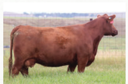
RED SIX MILE DIXIE 546C | DAM

Dam of Dixie 714J was the lead off choice lot in Genetic Focus Expanded Edition last fall, had she been selected; this female would not be for sale. We think this heifer is the real deal. She is bold and opened up in her forerib with a perfect foot under her. She carries an abundance of power and substance in an elegant, youthful package. Due early to John Wick, the G.O.A.T. of the Six Mile program. Bid early and bid often, she will not disappoint you.