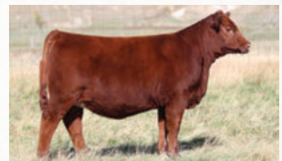
FRADO 344J | STARK DAUGHTER