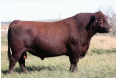
RED RAINBOW ROLEX 15F SIRE TO LOTS 51 - 58

I remember when this heifer hit the AI chute last spring, she was one of the first to cycle, I said to Ty "this may be the best heifer we breed this year" and I reminded him of that when she hit the picture pen. As an added twist, we nearly lost the dam of 361J in a sink hole last fall when grazing some drought stricken crop land at the neighbors. Her added frame, stature, body mass and intriguing pedigree make 361J a true sale feature for those that enjoy quality stock with a great story behind them!