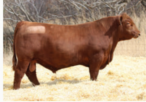
RED LWNBRG HOT WIRE 34H

BLACK WHEEL DRACARYS 178E X RED WHEEL ROSE 66C