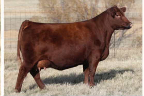
SIXM 238C | FULL SISTER TO LOTS 44 & 45

Choice of Full Sisters. One of the most prolific cow families in recent history. The Marta's are some of the hardest working, heaviest milking, and consistent breeders in the Six Mile cow herd. These two flush sisters are full sibs to Marta 238C, the $26,000 lead off female in last year's Genetic Focus Sale who has produced a long list of quality progeny, and Marta 816G, the dam of Lot 7 in this year's sale.