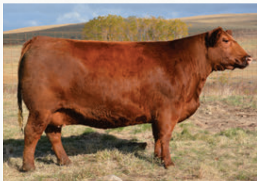
RED SIX MILE LAKOTO 35W | GRAND DAM