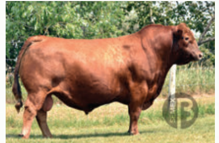
RED RAML PAYLOAD 9500 | SIRE

650J traces back to Lakota 162T, much like the two maternal sister pairings in Lot 34-37. We sampled RAML Payload before he hit the open market. His offspring show ample muscle shape in a sound structured skeleton. We think very highly of this heifer, she combines an athletic build with real muscle shape and an awesome cow family.