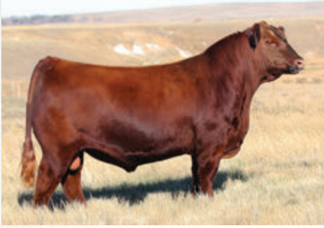
RED SIX MILE JOHN WICK 882E

REG NO. 1994984 TATTOO SIXM 882E DOB FEBRUARY 19, 2017