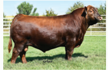
PIE CAPTAIN 057 | SERVICE SIRE

Feature bred heifer here! This Stark daughter checks all the boxes. She stems from the high profile "Lakota" cow family that was so influential at Las Rojas. 293J is due early to the new exciting sire from the Pieper program, Captain. We love her added athletic structure, the soft turn to her flank and perfect teat placement.