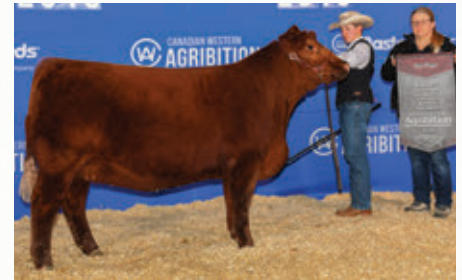
RED SIX MILE MS HAMILEE 128F | DAM