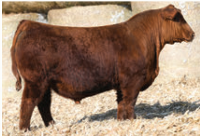
RED WEBER BRANDO | SERVICE SIRE