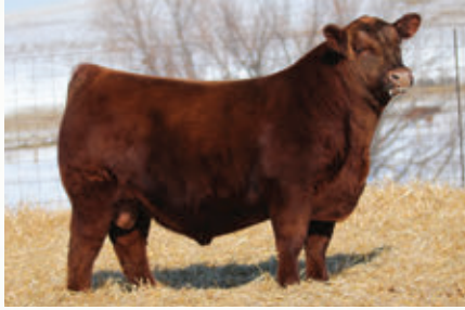
JOHN WICK 882E | SIRE OF LOTS 2 & 3

Full Sister to Semex/Moose Creek sire "Mossy Oak". From one of our highest quality and most consistent flushes, Lark 12K and Lark 35K represent the future generation of Lark's! As an added bonus to her stunning phenotype, 12K sports a very impressive EPD profile with 9 traits in the top 35% of the breed including top 10% for CE and Maternal CE. This heifer was the most enjoyable female in the picture pen, she is sound and proud! And check out that hair coat, super shaggy.