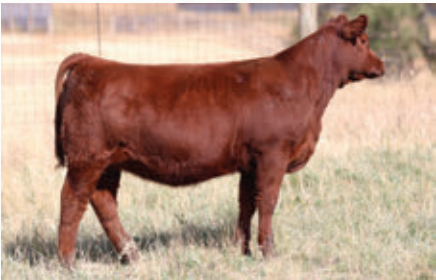
RED SIX MILE MISSY 204K

19 REG NO. 2260225 TATTOO SIXM 204K BIRTH DATE Feb 17 2022