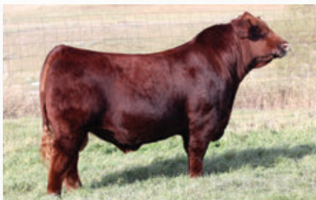
RED SIX MILE FLAGSHIP 506F SIRE TO LOTS 42 & 43