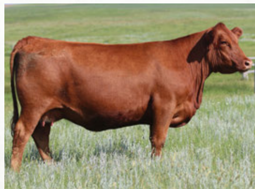
RED SIX MILE MISS LARK 225E | DAM