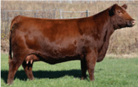
RED SIX MILE CHETA GIRL 144B | DAM

11 REG NO. 2274819 TATTOO SIXM 437K BIRTH DATE Mar 17 2022