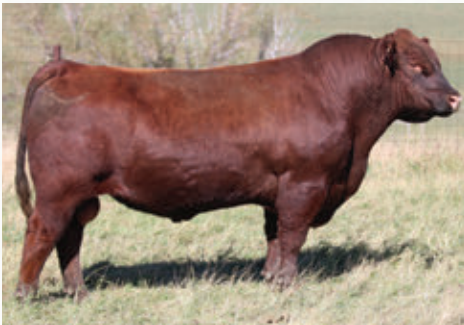
RED 3SCC NORTHBOUND F344

PIE QUARTERBACK 789 X PIE BONNE BEL 852C