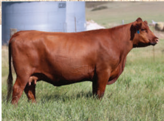
RED SIX MILE WITZEL 84F | DAM