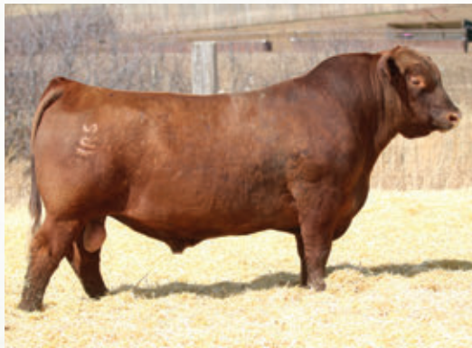
RED RIDGE WRANGLER 9096 | SIRE