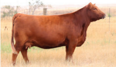
RED SIX MILE MARTA 11H | DAM