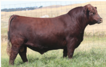
RED SIX MILE GENTRY 342G | SIRE

Moderate, shaggy and great colored. This is another heifer that stems to the highly productive Lark cow family. She was raised by a hard-working, sound footed Powder River daughter that displays a tight tidy udder with awesome teat size. Adding Gentry to the mix on the top side of her pedigree only adds to her maternal value.