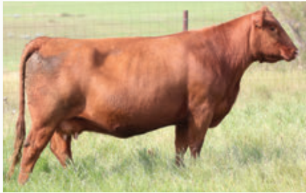
RED SIX MILE LAKOTA 213C | DAM

Another choice lot from the Lakota cow family. Here's a great story, Lakota 213C was supposed to be in the Genetic Focus sale last fall because we sold all of the "C" model females. 213C is a ranch cow, she is protective at calving time, she knows where you are before you step foot in her pasture and she took one look at the video pen last fall and excused herself very quickly. So, we pulled her out of the sale, which worked out just fine because we are now able to feature this pair of maternal sisters! This Hotwire heifer calf is cowy; big bodied, soft flanked and has a much more mellow disposition than her mother!