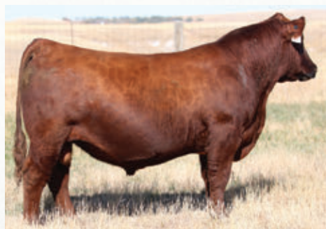
RED PIE COMPLETE 112

RED SIX MILE BRANDO 666C X RED VF VICTORIA JOAN D602-063