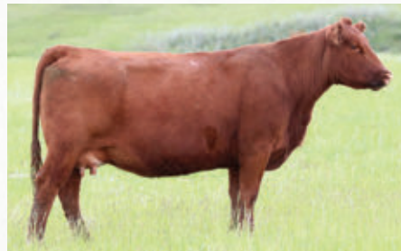
RED SIX MILE MS FRADO 32F | DAM

Choice of maternal sisters. We started doing these maternal sister choice lots last fall and they were well received. As a seller, it allows us to showcase some of the really solid ranch cows that are producing at a high level (without the cow being in the ET program). Some of these cows may end up entering our donor program and some will just be great ranch cows. Frado 32F will most likely be one to hit the donor program. This Lincoln daughter is beautiful and she has always had "the look". She is slim and tidy necked and then opens up with a bold forerib and hip. The dense muscle pattern, attractive skull and beauty teat spacing is evident in both females in this choice lot.