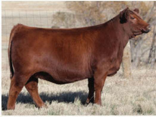
LARK 420D | MATERNAL SISTER

5 REG NO. 2259713 TATTOO SIXM 55K BIRTH DATE Feb 02 2022