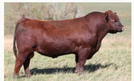
RED 3SCC NORTHBOUND F344 | SIRE

I love cattle that appear to float when on the move; when each and every joint work together with a full range of motion and stride length. Blackbird 512K demonstrates this at a high level. She is a larger outlined heifer for her age and is really long spined. I think this could be the sleeper heifer calf of the group that would be a great show heifer for the younger age divisions if someone is willing to put in the work on halter breaking her.