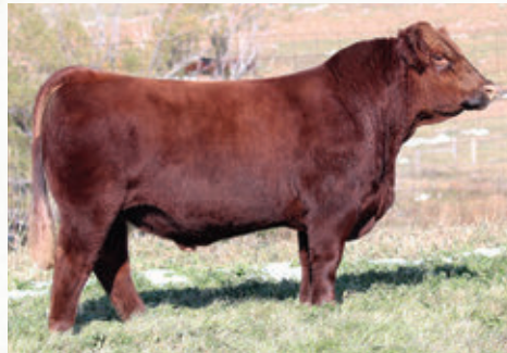
RED KJHT FCF ALIBI

RED VGW NAVIGATOR 010 X RED 3SCC POLLY B431