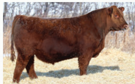
PRIVATE STOCK 32H | MATERNAL BROTHER