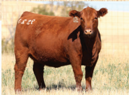
RED SIX MILE LAKOTO 952J