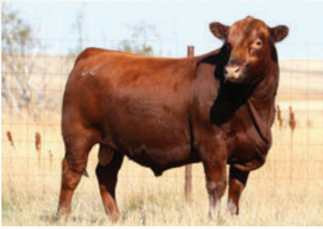
RED OHRR JACKSON 60A 5J

REG NO. 2256834 TATTOO IMP 5J DOB JANUARY 27, 2021