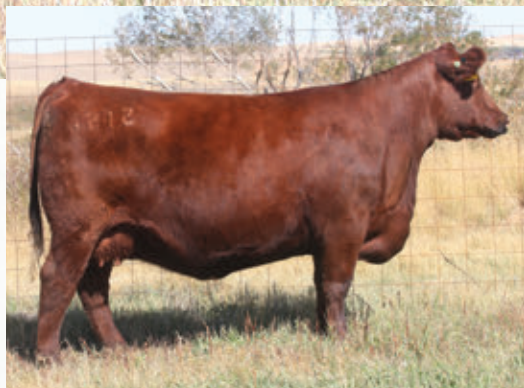
RED SIX MILE ALANA 515F | DAM