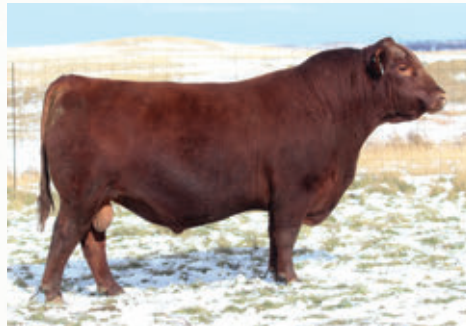
RED SIX MILE FIFTH SENSE 43F

RED SIX MILE JOHN WICK 882E X RED SIX MILE MISS LARK 225E