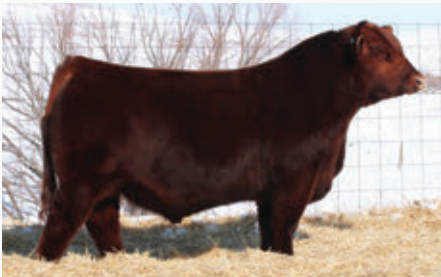
RED SIX MILE STEALTH 269F SIRE OF LOTS 19 & 20