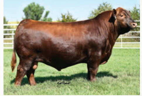
PIE CAPTAIN 057

RED LWNBRG ELECTRIC 4D X RED LWNBRG FLEX 85C