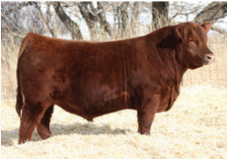
RED SIX MILE MOSSY OAK 175H

RED NCJ COMING IN HOT 24E X RED SIX MILE & CO LASSIE 417X