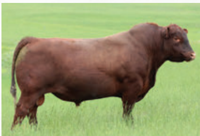
RED SUNRISE TYPHOON 604H SERVICE SIRE TO LOTS 51 - 53

A large outlined, high performing Rolex daughter bred early to Typhoon. Her dam is a gorgeous uddered Unanimous daughter with a high maternal instinct; she's one of our favourite young producers. 533J didn't take her best picture but I guarantee you will find her on sale day.