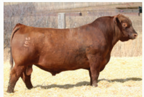
RED RIDGE WRANGLER 9096

RED KJL/CLZB COMPLETE 7000E X RED PIE FAYETTE 9237