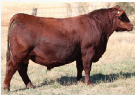
RED WEBR BRANDO J113

RED COCKBURN ASSASSIN 624D X RED RAINBOW DOLL 8D