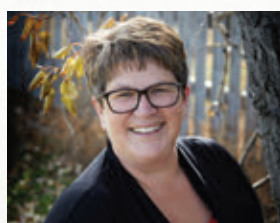
RAE TUTOR OFFICE MANAGER