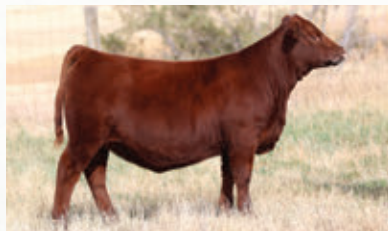
MARTA 60K | STARK DAUGHTER