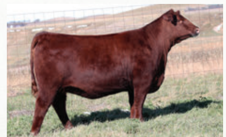
RED SIX MILE FLOWER 209F | DAM

The Wick x Barry pedigrees go together like peanut butter and jam. You get the stout features and awesome color from Barry, the loose and flexible structure and added presence from John Wick. Plus, you double up on foot design, maternal instinct and mothering ability from both sides. This heifer will be a safe investment as a great replacement female.