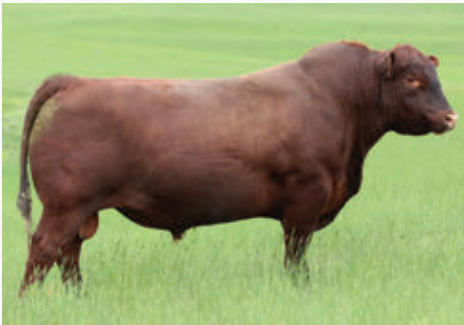
RED W SUNRISE TYPHOON 604H

RED 3SCC NORTHBOUND F344 X RED SIX MILE MS TAFFETA 142B