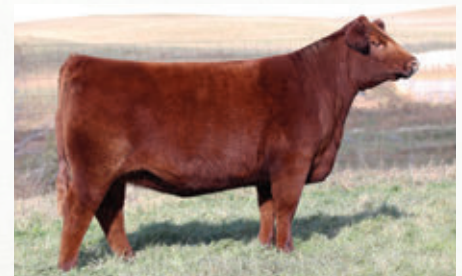
RED SIX MILE MS PATHY 314F | DAM

Pathy 314F is a past Agribition Reserve Champion Female, but her true worth has been in production. She has produced 2 high selling heifers selling to Dustin Buchert in MN and Walsh's in Ontario. She boasts an impressive 123 wean ratio and is a full sister to the donor dam of Lot 27. Pathy 300K is awesome haired and loose hid with extra dimension in her hip.