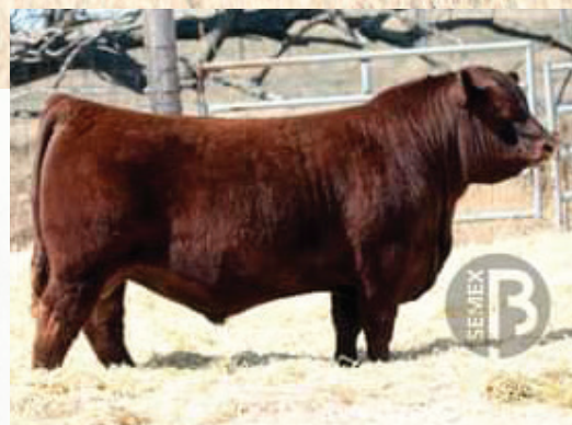
MOSSY OAK 175H | FULL SIBLING