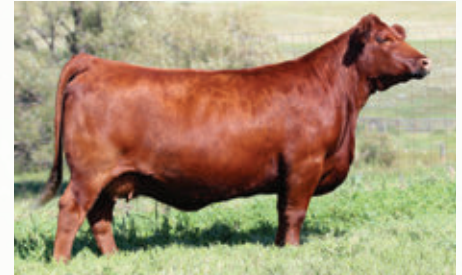
RED SIX MILE MISTY 809E | GRAND DAM

We figured we needed to sell this heifer in hopes to end the bad luck associated with the Misty's on this ranch. Granddam to 17K, Misty 809E was an amazing cow that was slated to enter our donor program but she decided to get stuck and die inside a culvert in the winter months prior to calving. 17K's dam, Misty 205H, cast herself on the bedpack just weeks after 17K was born... we can't make this stuff up... there is a quote that I think is very fitting for all of us trying to make a living in this industry "Owning livestock allows one to be in control of everything, but completely powerless at the same time". Misty 17K is a big bodied, cherry red Lincoln female with a pedigree stacked full of maternal greats!