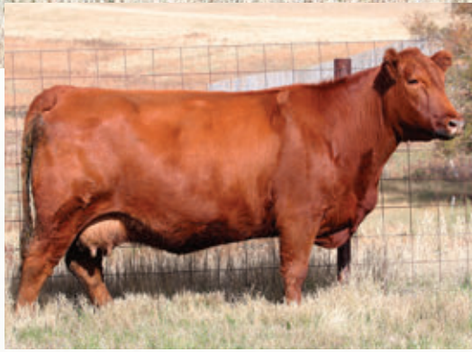
RED SIX MILE MISS LARK 855A | DAM